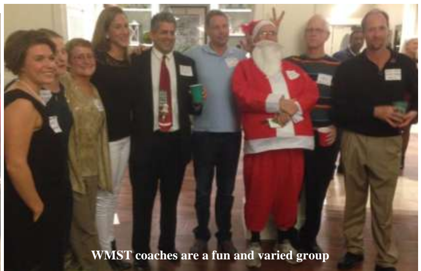
WMST coaches are a fun and varied group